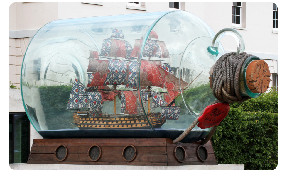
Nelson's Ship in a Bottle

Nelson's Ship in a Bottle (2010) by Yinka Shonibare was the first commission for Trafalgar Square by a black artist. It symbolises and celebrates the story of multiculturalism in London.