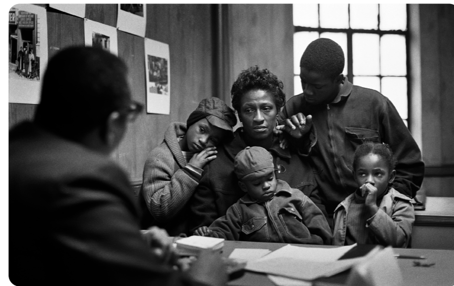
The Fontanelles at the Poverty Board

The Fontanelles at the Poverty Board (1967) by Gordon Parks shows a poor, black family in New York, symbolising the hardship many endured in the USA.