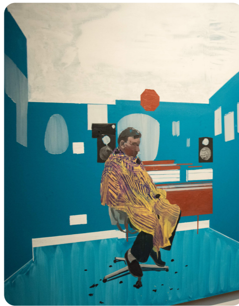
Peter's Sitters 3

Peter's Sitters 3 (2009) by Hurvin Anderson connects his Caribbean heritage with life in England. Colour symbolises his Caribbean heritage, while the barbershop symbolises an important aspect of life in England to Afro-Caribbean immigrants.