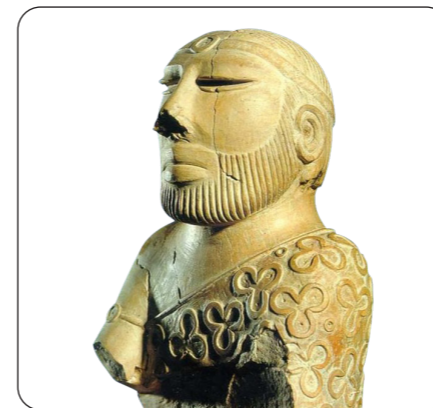
Indus Valley statuette