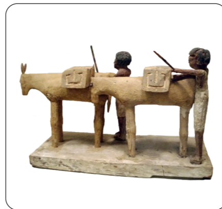
Ancient Egyptian figurines

The making of statues, statuettes and figurines is an ancient craft. It was an important part of the culture of past civilisations, including ancient Sumer, ancient Egypt and the Indus Valley. The sculptures made by these civilisations include important people, such as monarchs and religious deities. They also tell us about the everyday lives of the people who were part of these ancient civilisations and the things that were important to them.