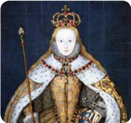
Coronation Portrait by unknown artist, c1600