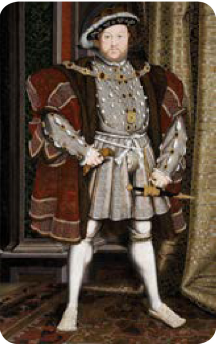
Henry VIII by Hans Holbein the Younger, 1537–47