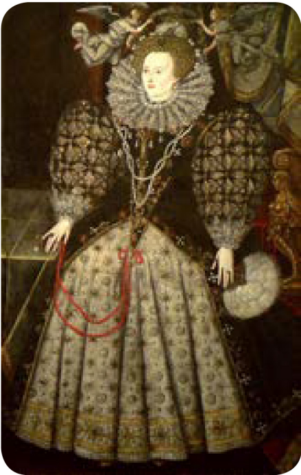
Portrait of Elizabeth I of England attributed to Nicholas Hilliard, 1590