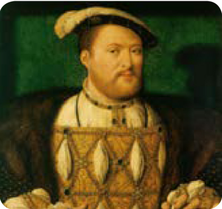
Portrait of Henry VIII by Joos van Cleve, c1530–1535

A portrait is a painting or photograph of a person. It usually shows their head and shoulders, but may show their whole body. Before cameras were invented, kings and queens often had official portraits painted to show how powerful and important they were.