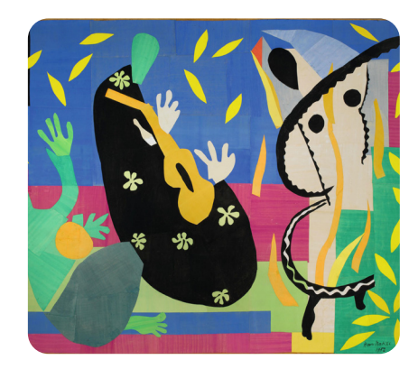
Sorrow of the King by Henri Matisse, 1952