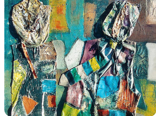
mixed media collages