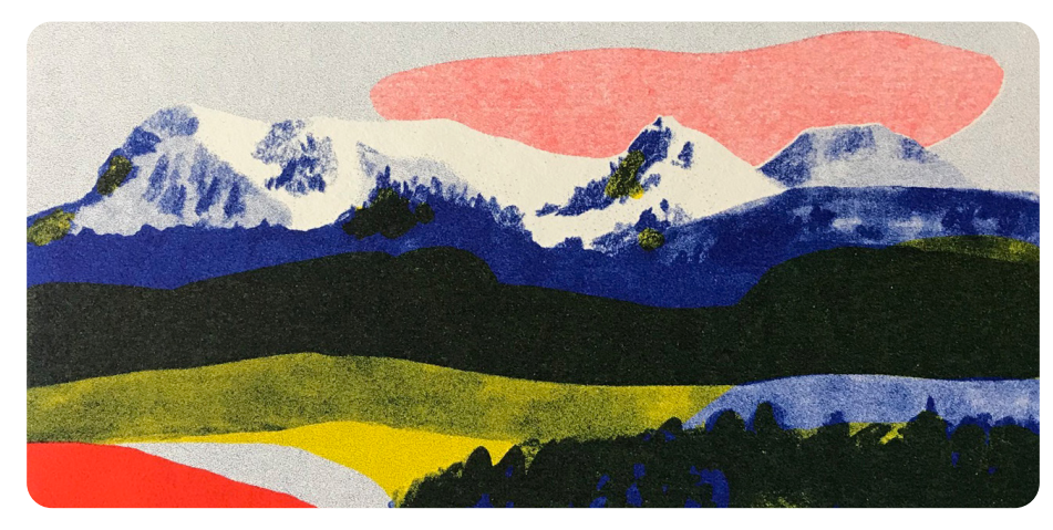
Mountains by Fanny Dreyer, 2019

Collage is art in which pieces of paper, photographs, fabric and other objects are arranged and stuck down onto a supporting surface or background. Collages can be abstract or pictorial.