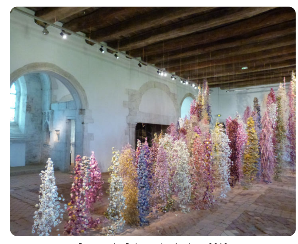
Banquet by Rebecca Louise Law, 2019

Some land artists bring materials inside from the outdoor environment to create installations in galleries and exhibition spaces.