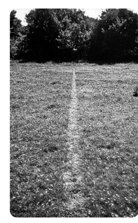
A Line Made by Walking by Richard Long, 1967

Land art can be made from many materials. Some artists sculpt the land into pieces called earthworks. Other artists use natural materials, such as twigs and rocks, to make sculptures within the landscape. Land art may be temporary, such as A Line Made by Walking. Richard Long made this line in the grass by repeatedly walking backwards and forwards.