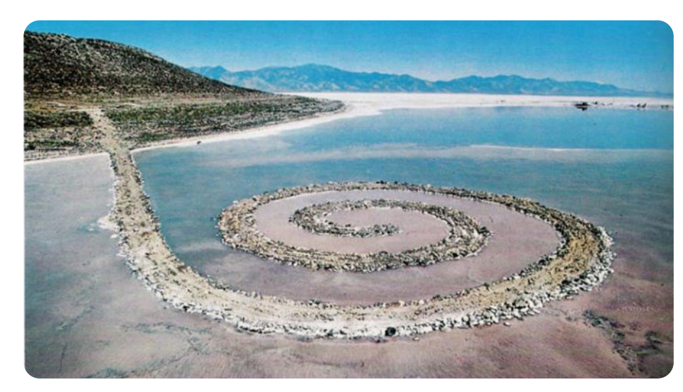
Spiral Jetty by Robert Smithson, 1970

Land art, or Earth art, is art that is made within the landscape. Land art is usually captured using photography because it is temporary and often made on a large scale.