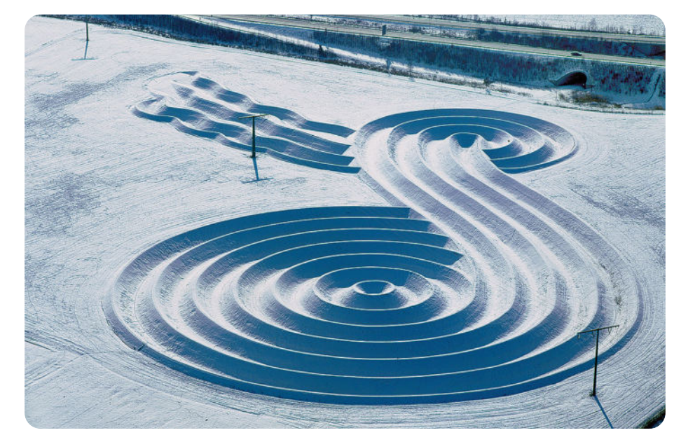
Earth Sign by Wilhelm Holderied, 1995

A relief sculpture projects from a flat surface. A high relief sculpture clearly projects out of the surface and looks like it is freestanding. A low relief, or bas-relief, sculpture does not project far out of the surface and is visibly attached to the background.