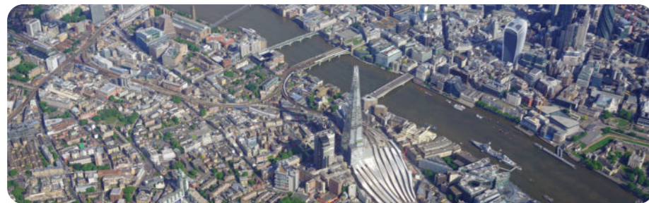
Aerial view of London

A city is a large, busy settlement where lots of people live and work. A city usually has a cathedral, a river, important buildings and offices where people work. There are lots of things to see and do in a city. There are many shops and restaurants to visit.