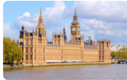
Houses of Parliament

London is a city. It is the largest settlement in the United Kingdom. Over eight million people live there. The River Thames is the main river that runs through the city. Tourists visit London to shop and see its famous landmarks.