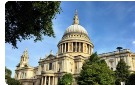
St Paul's Cathedral