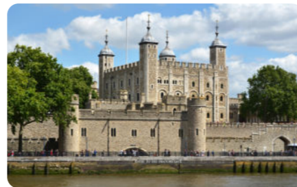
Tower of London