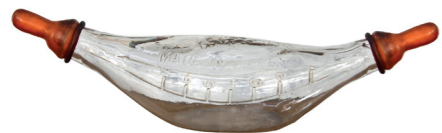
Victorian baby bottle

An artefact is an object from the past. Museums often display historical artefacts. Artefacts can tell us about how people used to live. Everyday objects like baby bottles, clothing, toys and books can tell us about childhood in the past.