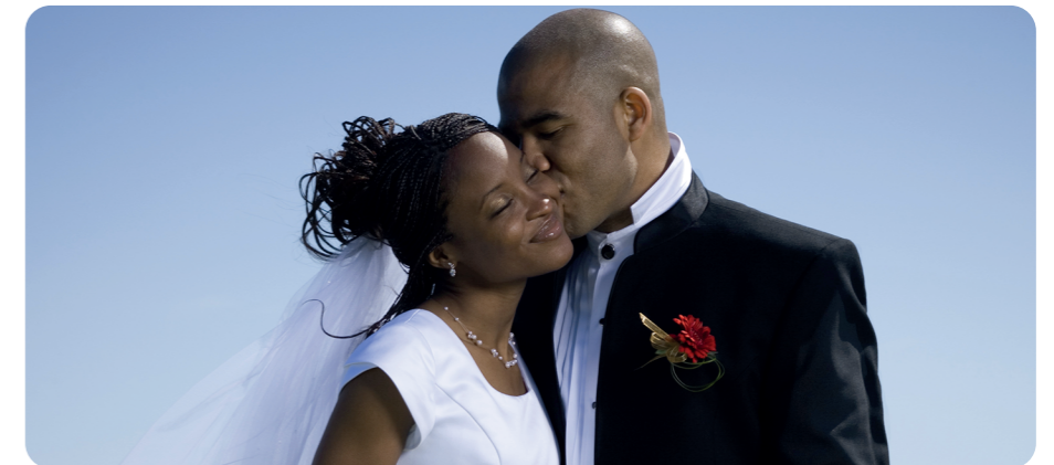
Weddings happen when two adults get married.