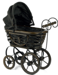
wood and metal pram