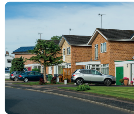
A street today.