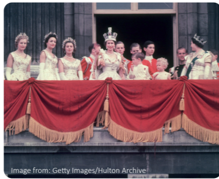
Queen Elizabeth II on her coronation.

A coronation is a ceremony where the crown is placed on the head of the new king or queen. Elizabeth II was the Queen of the United Kingdom for 70 years until she died in 2022. The coronation ceremony of Elizabeth II took place on 2nd June 1953 at Westminster Abbey, London. Many people celebrated the coronation by holding street parties.