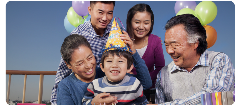
Birthdays happen every year.

Important life events include birthdays, religious festivals or family celebrations. Some life events happen every year and some happen at certain stages of human life.