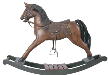
wooden rocking horse