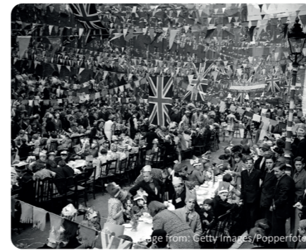
Street party to celebrate the coronation.