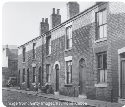
A street in the 1950s.

The way people use land changes over time. For example, in the 1950s there were fewer cars, so fewer roads were needed. Today lots of people have cars, so there are many more roads for people to drive on and driveways for parking.