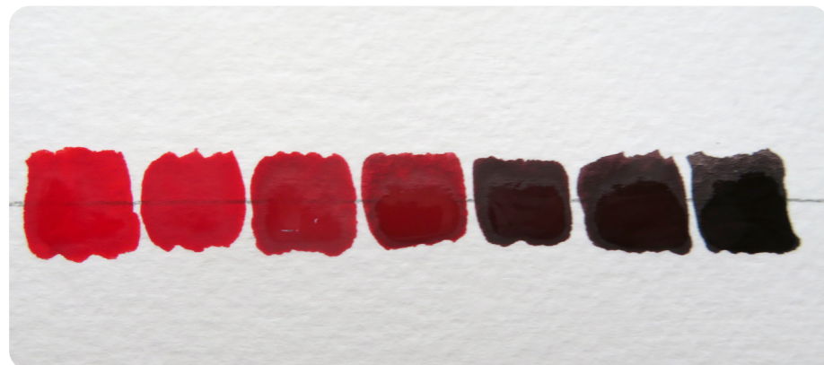
shades of red

A shade is a colour mixed with black. The more black paint that is added to the original colour, the darker the shade. A shade can range from slightly darker than the original colour to nearly black. When mixing a shade, begin with the pure colour and add black paint a tiny bit at a time.