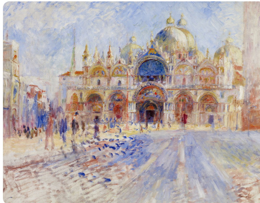
The Piazza San Marco by Pierre Auguste Renoir, 1881

In this painting by Pierre Auguste Renoir, a bright, soft colour palette is used with lots of tints to emphasise the effect of light.