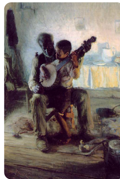
The Banjo Lesson

The Banjo Lesson (1893) by Henry Ossawa Tanner shows an elderly man teaching a young child the banjo, symbolising the resilience, intellect and caring nature of the once enslaved African American people.