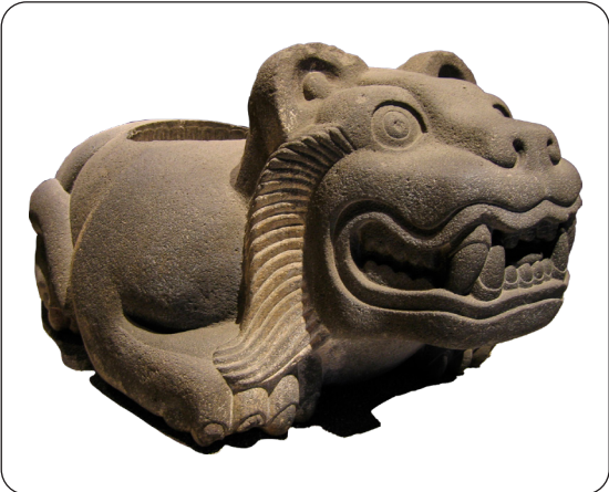
Aztec jaguar cuauhxicalli (eagle gourd bowl), c1300–1521 BC

Some ancient cultures used animal sculptures to represent the gods and used vessels in the shape of animals in religious rituals. Many artworks show the close relationship between humans and animals on the farm or in the home. Others show human dominance over animals, as the animals have been put to work or been hunted.