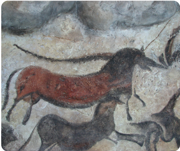
Prehistoric cave painting, c17,000–c15,000 BC

Animals have appeared in art from the prehistoric period to the modern age. Some early artworks were simplistic, consisting of simple lines and shapes. However, some sculptures in bone, stone or ivory show great detail, revealing that some ancient civilisations were more advanced than others. Later artworks were more realistic, capturing minute, anatomical details. Some modern artworks are surreal, exaggerating the animals’ actual form to make a statement.