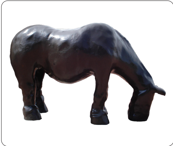
Untitled (Horse on Square) by Tom Claassen, 1996