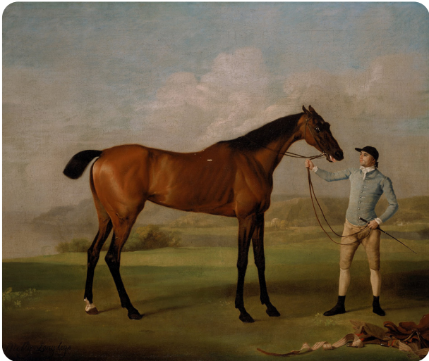
Molly Long-legs with her Jockey by George Stubbs, 1762