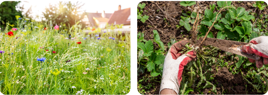
wild, uncut areas