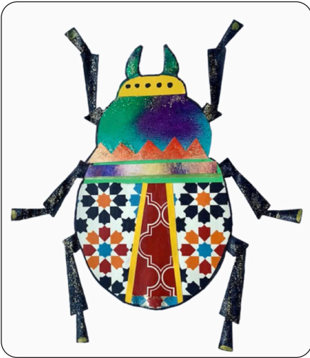
mixed media collage

The term 'mixed media' describes artwork that uses more than one medium. Materials used to create mixed media art include paint, paper, fabric, wood and found or decorative objects. Collage is a type of mixed media art. When collaging, artists select different mediums. They cut or tear the mediums into pieces, arrange them in a variety of ways and choose a method, such as gluing or stitching, to attach them onto a supporting surface or background. Embellishments, such as sequins and buttons, can also be used.