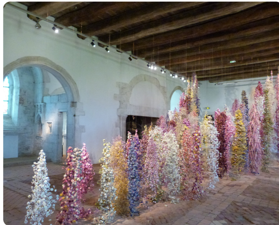
Banquet by Rebecca Louise Law, 2019

Some land artists bring materials inside from the outdoor environment to create installations in galleries and exhibition spaces.