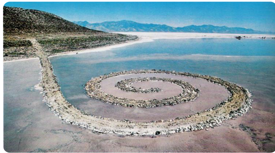
Spiral Jetty by Robert Smithson, 1970

Land art, or Earth art, is art that is made within the landscape. Land art is usually captured using photography because it is temporary and often made on a large scale.