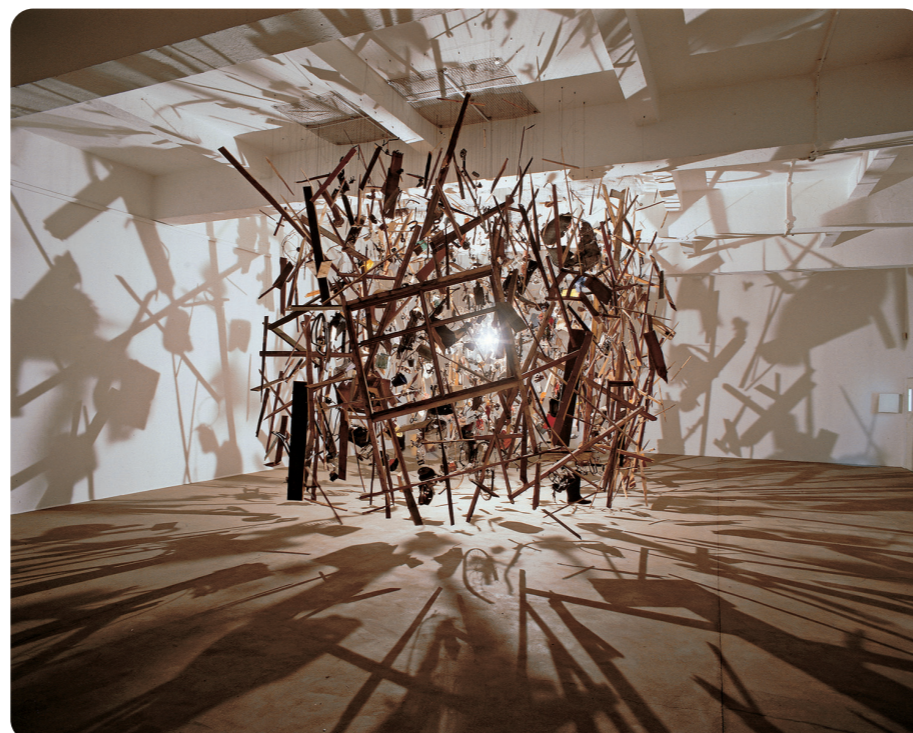
Cold Dark Matter: An Exploded View by Cornelia Parker, 1991