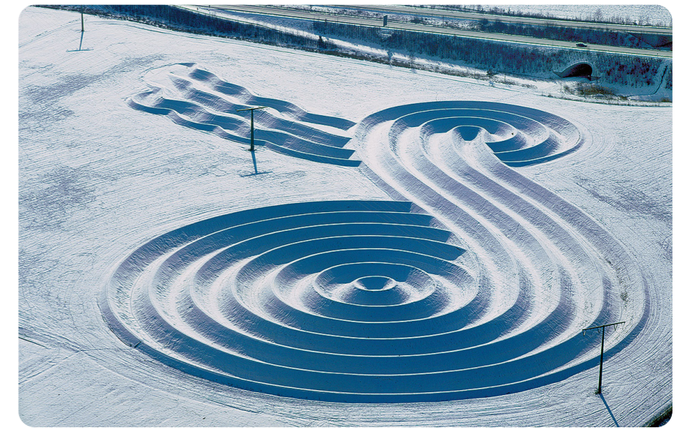
Earth Sign by Wilhelm Holderied, 1995

A relief sculpture projects from a flat surface. A high relief sculpture clearly projects out of the surface and looks like it is freestanding. A low relief, or bas-relief, sculpture does not project far out of the surface and is visibly attached to the background.