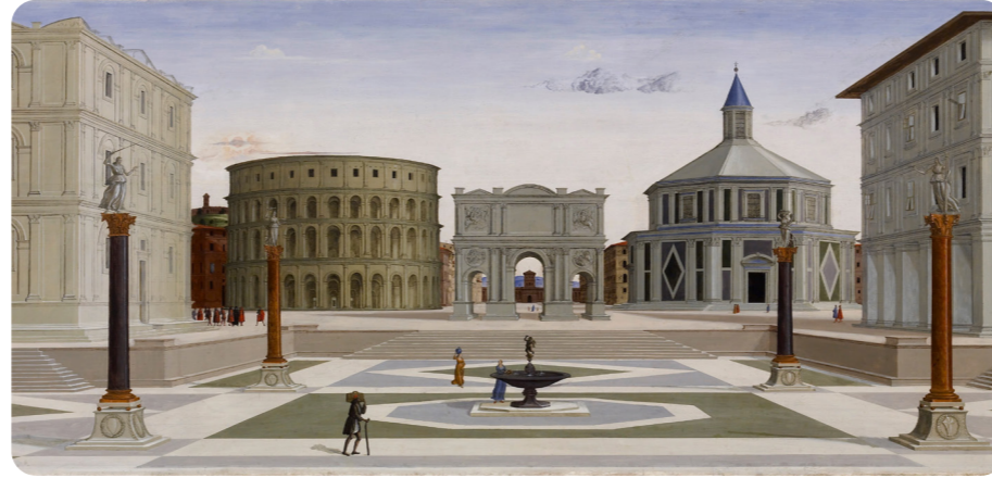
The Ideal City by Fra Carnevale, c1480–1484

Urban landscapes are drawings of towns and cities shaped by the people and buildings found there. Different atmospheres are created using bright, dark or muted colours and sharp or blurry lines.