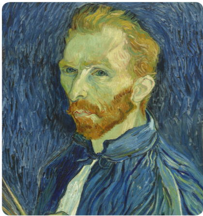
Self-portrait, Vincent van Gogh, 1889

A self-portrait is a portrait that an artist produces of themselves. Vincent van Gogh painted many self-portraits.