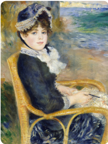
The textures of these two portraits are similar but the colours are different.